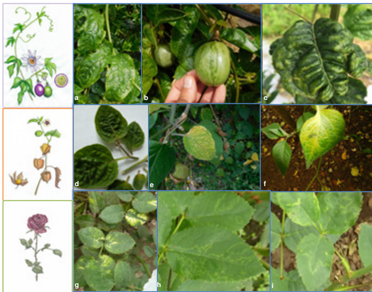
Fig 2: Virus suspected symptoms: blistering of leaves (a-c), and deformation of passion fruit (b). Local leaf blistering (d), mottling, and yellowing (e,f) of physalis leaves. Oak leaf pattern (g-i) in rose leaves.